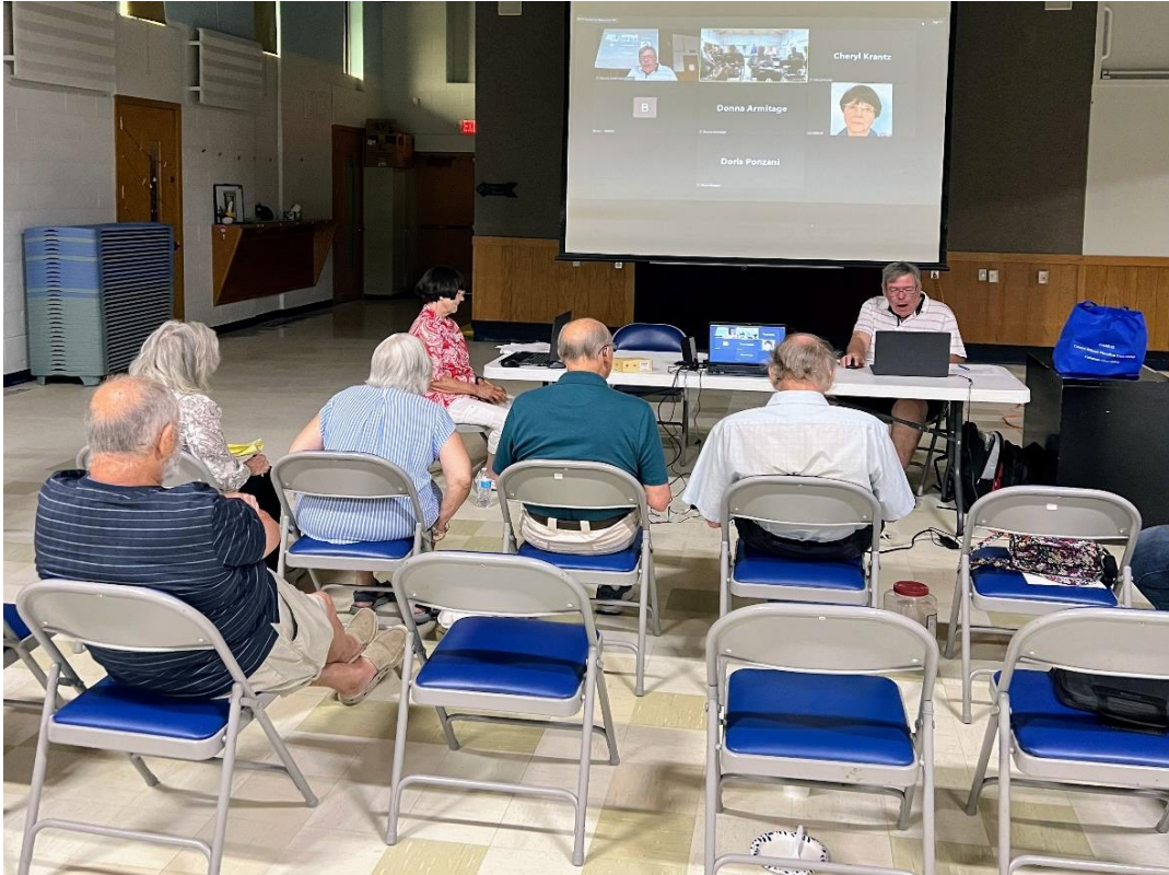
CAMUG Meeting – August 21, 2023