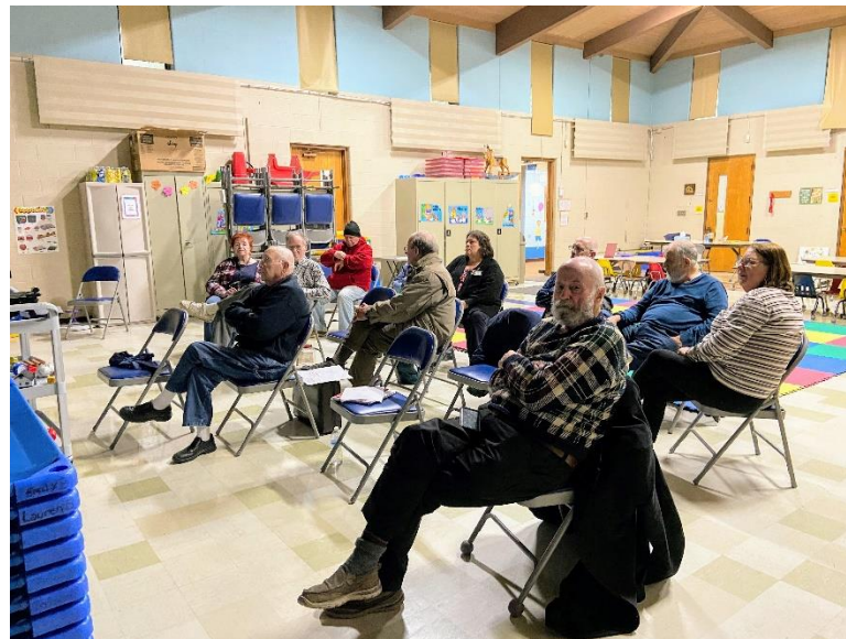
CAMUG Meeting – April 18, 2022