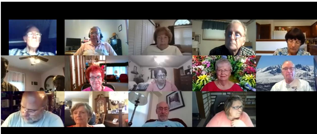
CAMUG Zoom Meeting, August 17, 2020